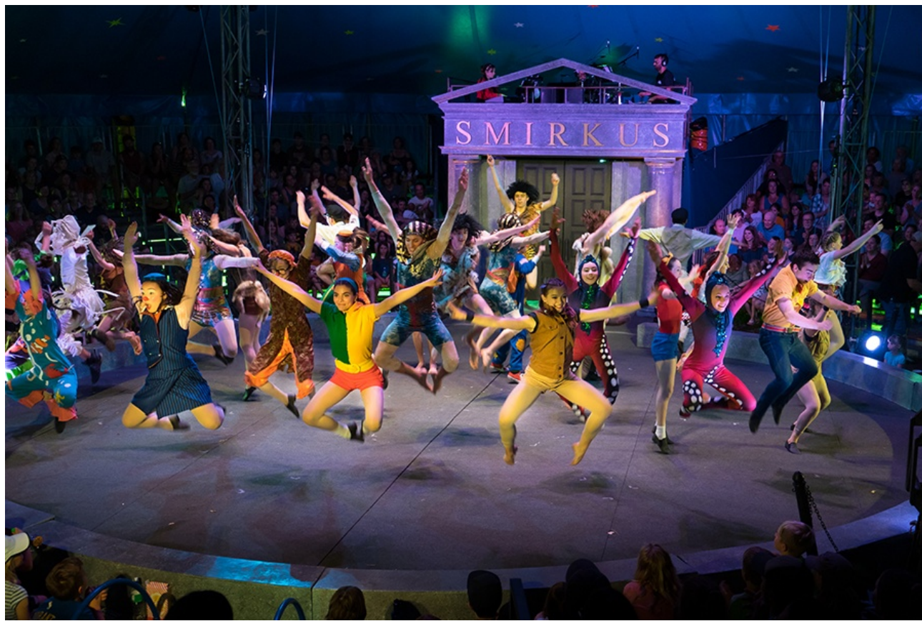
See Circus Smirkus perform May 6. Photo provided