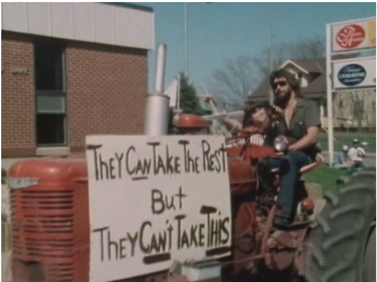
A scene from the Oscar-winning documentary "Down and Out in America," narrated and directed by Lee Grant.

“20 th Century Woman: The Documentary Films of Lee Grant,” presented online via the Coolidge Corner Theatre website